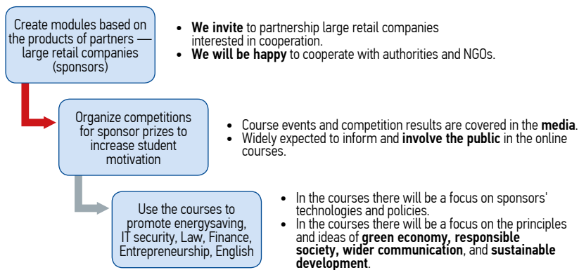
Figure 4 — Post-project sustainability ideas

Thus, for the further development of educational activities and improvement of distance education, Belarusian universities are advised to continue the implementation of the best practices of universities in developed countries, to intensify networking and to promote the principles and ideas of Life Long Learning, to actively involve government bodies, business, NGOs, local communities in these processes.