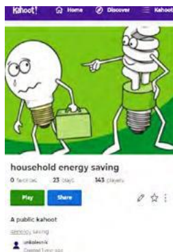
Figure 2 — E-Quiz of the Energy Saving course

presentation, methods of studying and subsequent solution of complex or tricky problems are used. These methods are aimed at detailed presentation of the problems (Rich Pictures), as well as a detailed description of the structure of the system (System Maps). The use of the Rich Pictures methodology made it possible to present students with an interactive, simple and understandable curriculum for a blended LLL course “Household Energy Saving” (Figure 3).